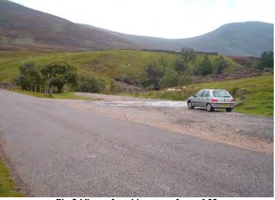
Fig 2 View of parking area from A93

1. The site of this application is an informal parking area on the east side of the A93, on the outside of a bend in the road. The site is immediately adjoining the road opposite Auchallater Farm. The site is bounded by the Callater burn running down from Loch Callater, the burn is part of the River Dee Special Area of Conservation (SAC), a vehicle hill track loops around the back of the parking area and heads up to Lochallater Lodge. The site is within the Deeside and Lochnagar National Scenic Area.