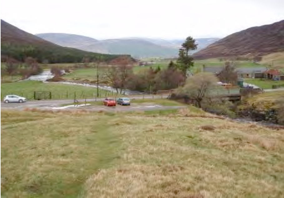
Fig 3 View of site looking towards A93